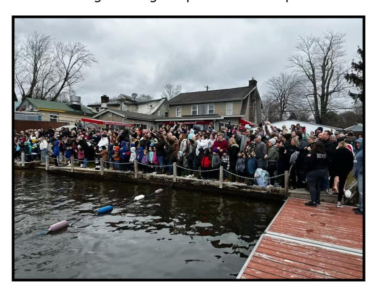
District 2 Commander continued on page 19

Back at home in district 2 Mahopac Post 5491 held a Polar Plunge calling it Operation Ice Splash.