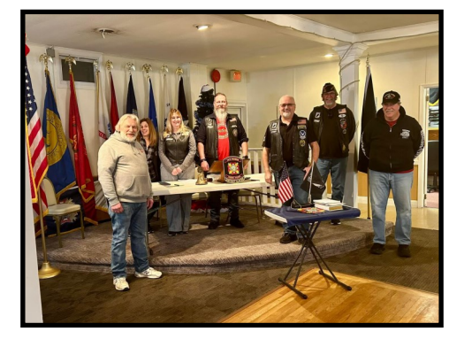
District Commander 11 continued on page

Our Riders support the monthly NOA Ceremony at Calverton Cemetery and held their first meeting of the season.